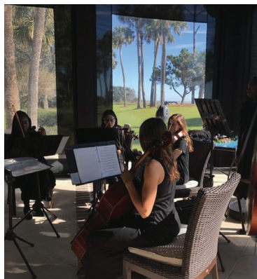
Golden Isles Youth Orchestra Ensemble