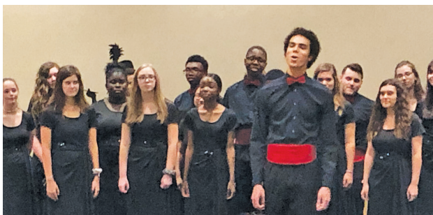
Glynn Academy Show Choir